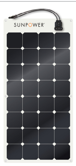
Please read the safety and installation guide. Document # 523809 Rev F / LTR_US